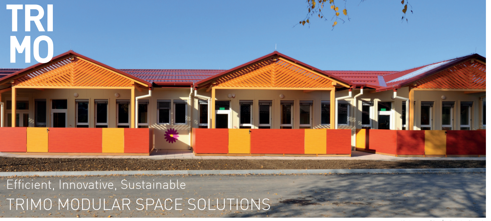
Kindergarten Biba, Škofja Loka, Slovenia